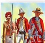
HEIC Soldiers 17th Century

The largest irregular private army, more than any other European power – twice the size of Britain's military which was busily engaged in war with Europe and American Independence.