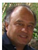
Noel French Finance

We have had interest from a number of our members prepared to invest, but unless ARAIA raises "Trust Funds" to at least $100,000 we cannot initiate any meaningful dialogue with investors.